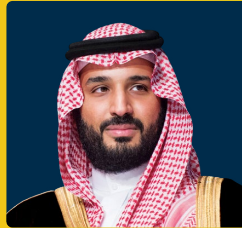
His Royal Highness Prince Mohammed bin Salman bin Abdulaziz Al Saud Crown Prince, Prime Minister