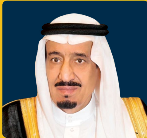
The Custodian of the Two Holy Mosques King Salman bin Abdulaziz Al Saud